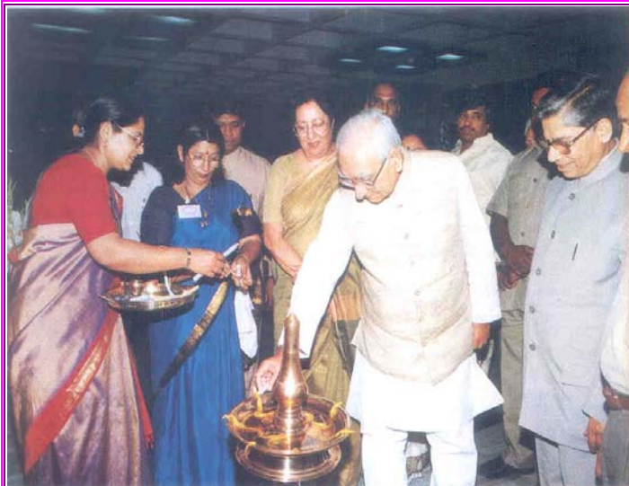
Shri Krishan Kant, Vice-President of India and Chariman, Rajya Sabha inaugurating the Orientation Programme for new members of Rajya Sabha. Dr.(Smt.) Najma Heptulla, Deputy Chairman, Rajya Sabha is also present on the occasion