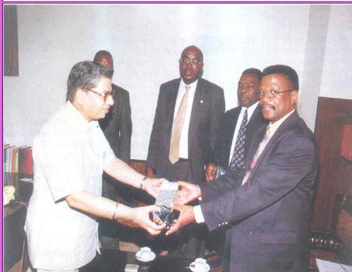
Namibian Parliamentary Delegation in Parliament House