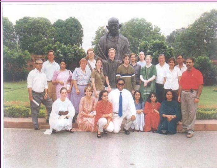
Professor and students of the Touro College, Law Centre, USA